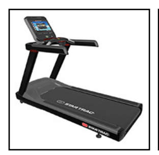
STAR TRAC 4TR Treadmill