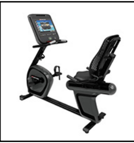
STAR TRAC 4RB Recumbent Bike