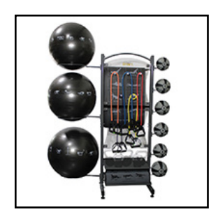
PRISM FITNESS Studio Deluxe Self-Guided Commercial Package