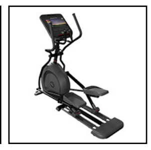
STAR TRAC 4CT Cross Trainer