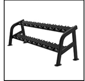
ТКО 10 Pair Signature Dumbbell Saddle Rack