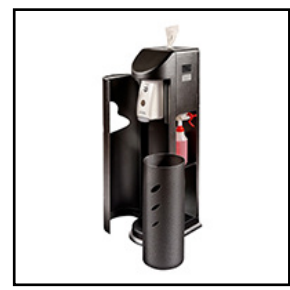
ZOGICS The Cleaning Station