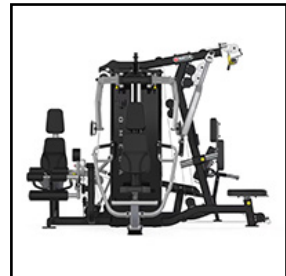
BATCA Omega Four Stack Multi-Station Gym with Leg Press