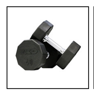
TKO 10-Sided Rubber Dumbbell