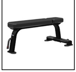
NAUTILUS Instinct® Multi-Adjustable Bench