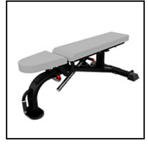
NAUTILUS Instinct® Flat Bench